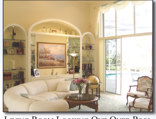
Living Room Looking Out Over Pool