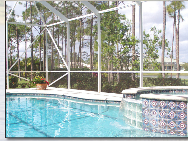
Breathtaking Views from the Pool