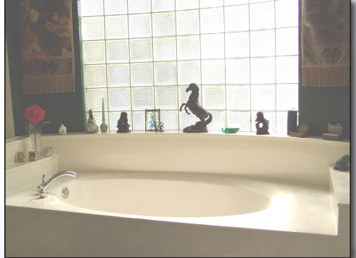
ROMAN TUB IN MASTER BATH

BUILT IN 1996, THIS ELEGANT DEVONSHIRE MODEL IS LOCATED IN PRESTIGIOUS BAY HILL ESTATES. FEATURING A LOVELY LAKE-FRONT TREED LOT AND MAJESTIC ROYAL PALMS, THIS HOME IS 4 BEDROOMS PLUS BONUS ROOM OR FIFTH BEDROOM. OTHER Notables include Crown Mouldings, Granite Counters, and Custom Built-ins. Home is Wired For Generator Power AND HAS ROLL DOWN ACCORDION AND ELECTRIC SHUTTERS, AND OUTDOOR LANDSCAPE LIGHTING.