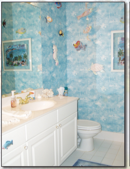
CUSTOM PAINTING IN BATHROOM