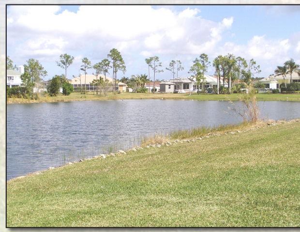
AUTOMATIC SPRINKLER SYSTEM USING LAKE WATER