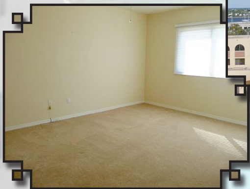
Lots of Space