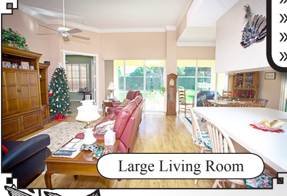
Large Living Room