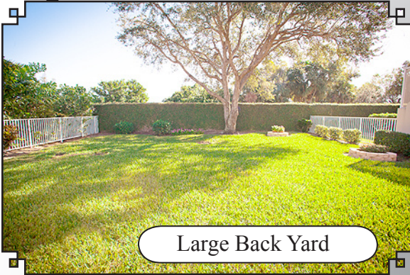
Large Back Yard