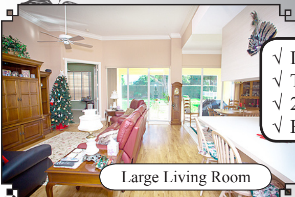
Large Living Room