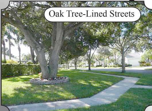
Oak Tree-Lined Streets