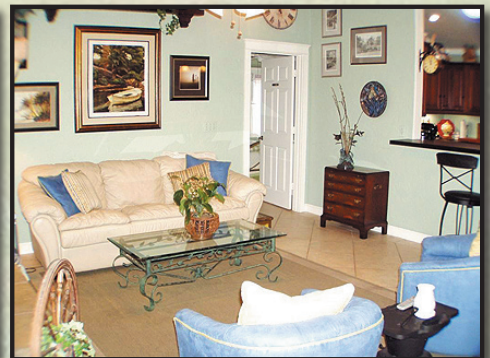
18' x 16' LIVING ROOM