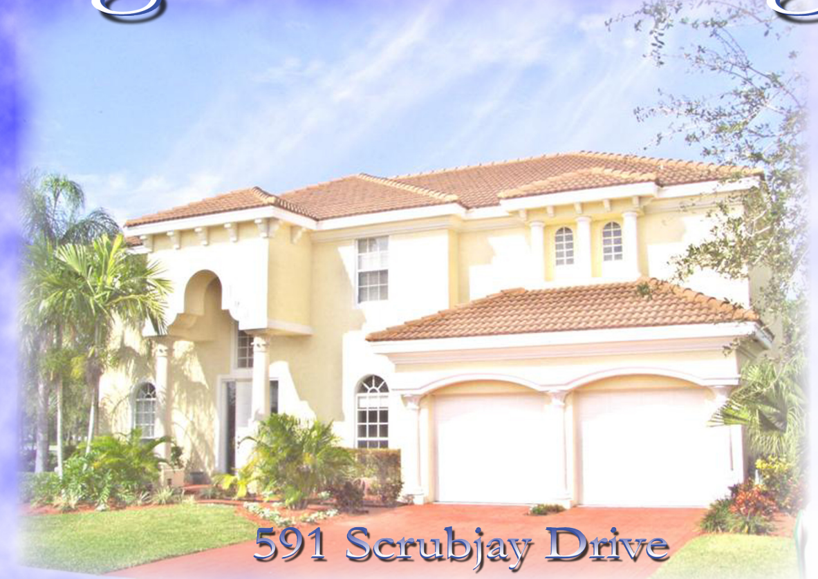
591 Scrubjay Drive

LARGE, GORGEOUS, TROPICAL BACK YARD WITH ROCK WATERFALL CASCADING INTO BLACK DIAMOND POOL. FORMER PULTE MODEL. IMMACULATE CONDITION IN A VERY OPEN FLOOR PLAN. UPGRADES INCLUDE CROWN MOLDING, WOOD FLOORS, AND FRENCH DOORS. UPGRADES INCLUDE KITCHEN WITH DOUBLE OVENS, 42" SOLID WOOD CABINETS, GE PROFILE APPLIANCES, CORIAN COUNTERS, AND DESIGNER WINDOW TREATMENTS AND CEILING FANS. 5 TH ROOM CAN BE A BEDROOM OR OFFICE. HI-HATS THROUGHOUT. LUXURIOUS MASTER BATHROOM WITH HUGE CLOSETS. LARGE 15' x 28' LIVING ROOM WITH VAULTED CEILINGS, CLERESTORY WINDOWS, AND BUTLERS PANTRY. $689,000