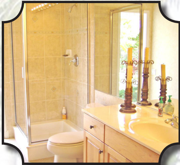
Beautiful Master Bathroom