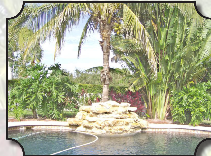
Pool with Waterfall