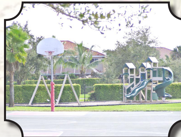
Community Park & Playground

Large, Very Private, Very Tropical Back Yard. Covered Porch, Open Tropical Black Diamond Pool with Rock Waterfall.