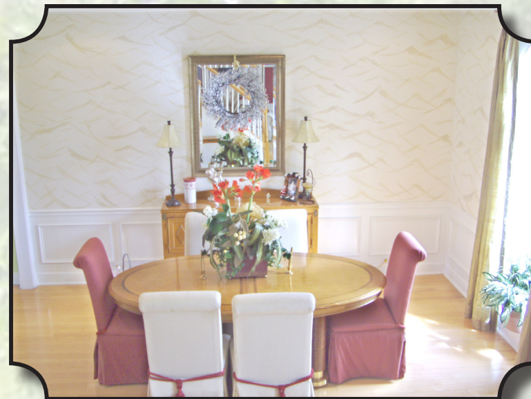
Formal Dining Room