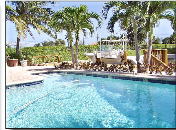
PRIVATE POOL AND DOCKS