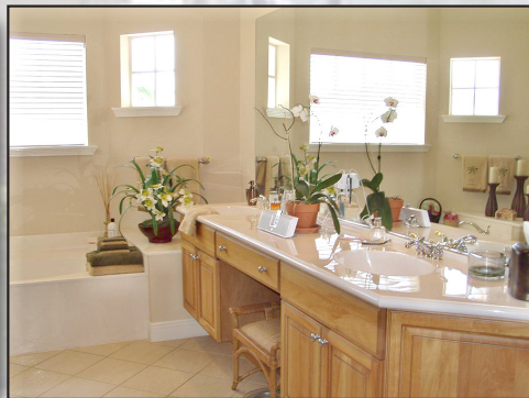
DUAL SINKS IN MASTER BATH