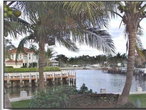
PALM TREES AND WATERWAY