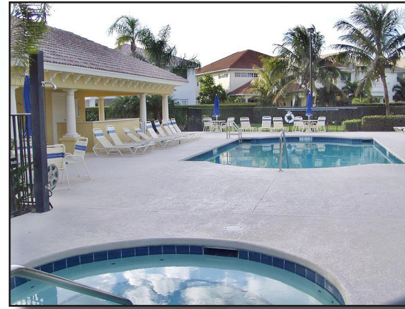
COMMUNITY POOL AND SPA