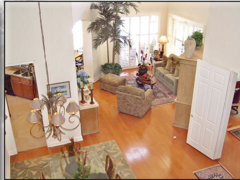
VIEW LOOKING DOWNSTAIRS