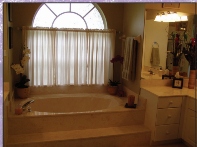
Master Bath with Roman Tub