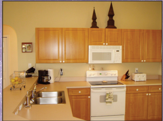
Gorgeous Custom Kitchen