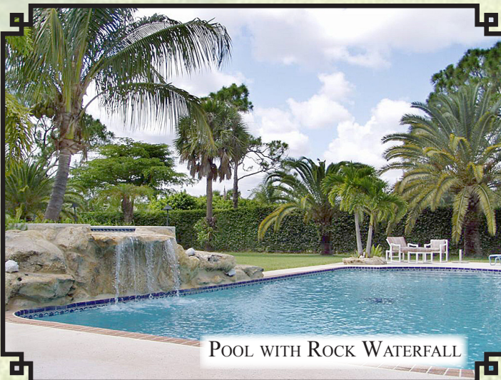
POOL WITH ROCK WATERFALL